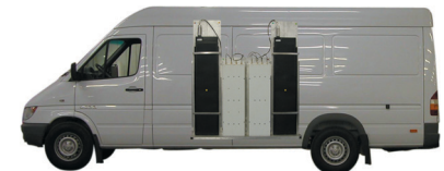
Cut-away view of the TSA MD134 mounted in a van for mobile screening. (Van is not included.)