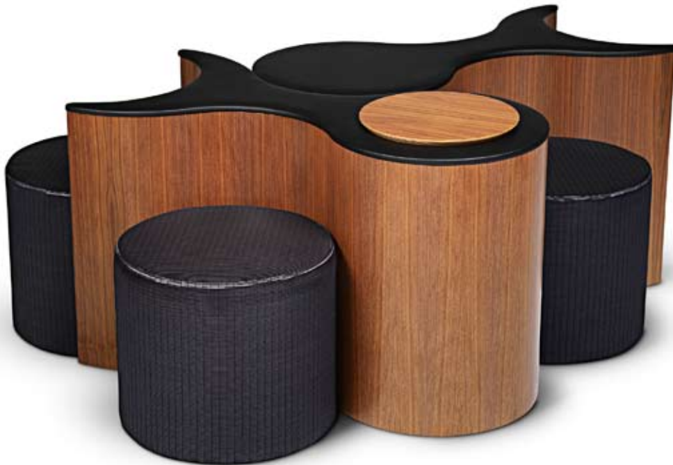
Molecule with Corian tabletop