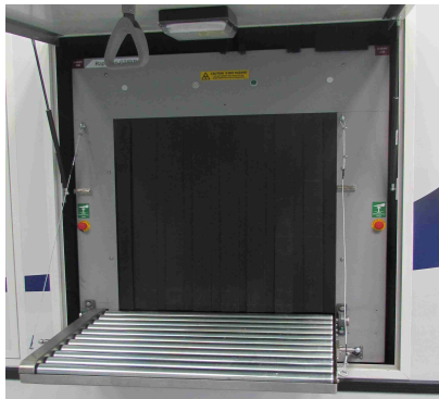
Tunnel Opening (width x height): 1,000 mm x 1,000 mm